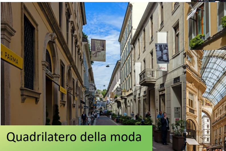
Quadrilatero della moda